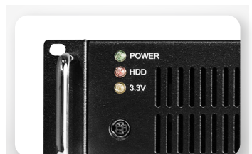
Power, HDD Indicators

*Specifications are subject to change without notice*